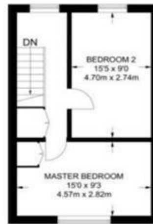
SECOND FLOOR 372 SQ FT / 34.6 SQ M