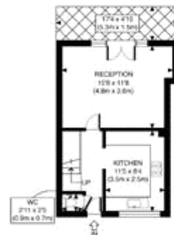
GROUND FLOOR GROSS INTERNAL FLOOR AREA 346 SQ FT