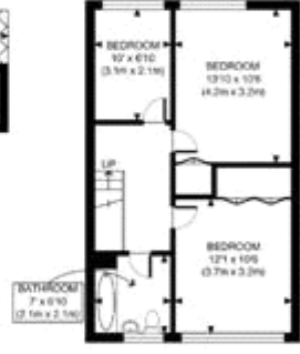
FIRST FLOOR GROSS INTERNAL FLOOR AREA 319 SQ FT

APPROX. GROSS INTERNAL FLOOR AREA (MS SQ FT) = 665 SQM Disclaimer: Floor plan measurements are approximate and are for illustrative purposes only. While we do not doubt the floor plan accuracy and completeness, you or your advisors should conduct a careful, independent investigation of the property in respect of its actual situation.